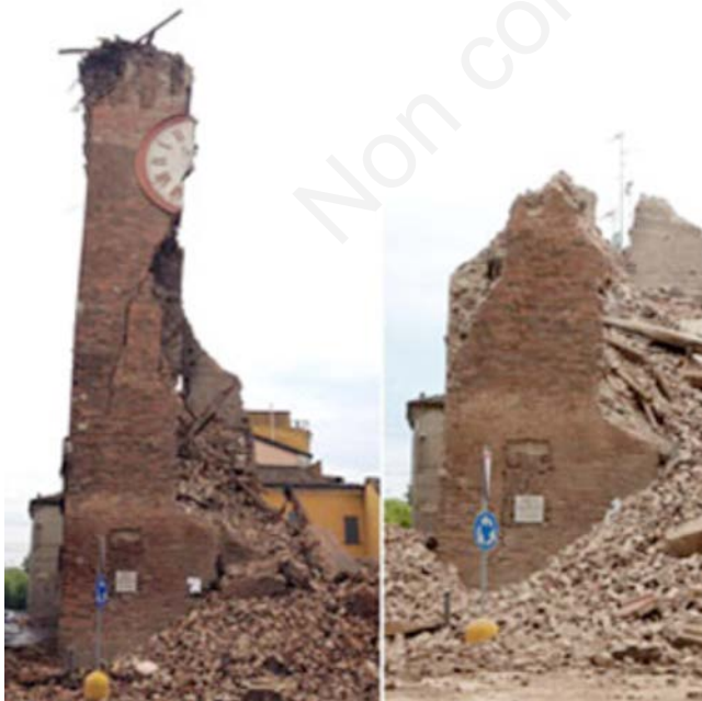
Figure 1. The consequences of the earthquake.

tended to increase. When it averaged 1200 µg/dL chelation was given, until a ferritin level of 500 µg/dL was obtained. The patient is also affected by precapillary pulmonary hypertension that is being treated with Bosentan.