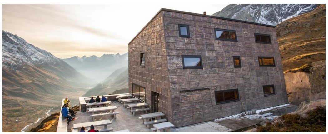
Figure 6. Lötschental, Switzerland, Cottage Anenhütte

Other cases for architectural applications include in industrial applications. FORTEShield (AFP) provides aluminum foam panels which are highly efficient in the noise control and sound absorption together with shielding electromagnetic and damping vibration. The application ranges as a noise barrier and reverberation time controller for acoustic insulation in workshops, machinery rooms, ME rooms, construction sites, highways, acoustic chambers, pipeline silencers, and architectural spaces such as libraries, meeting rooms, theatres, studios, KTV, stadiums, train stations, FB, retail, hospitality, and etc. Particularly, its application as sound absorption performance enhances at low frequencies.