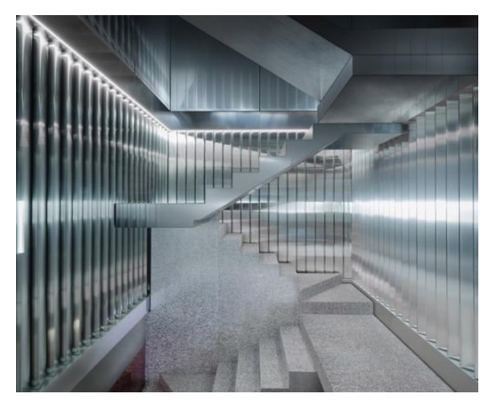
Figure 3. Left: OMA, Milan, Italy, interior and exterior cladding. Right: OMA, Paris, France, interior cladding, the steps on the lower section are made from aluminum foam

In Anenhütte cottage on heights of Alps in Ltschental, the AFS cladding carried out by Pohl in Switzerland 2015, presented an extra function by protecting the façade from the deterioration caused by weather conditions in the high altitude. In this case, the aluminum foam is not only responding to the apparent features but performing a crucial act according to its properties. The enclosure required a lightweight, stable and functional material responding to the gale-force winds, UV radiation shield, temperature variations and the unusual compressive loads from the snowstorms. Considering the criteria of energy efficiency in this human-nature interface structure, on one hand, the shape of the façade structure is fitting into the landscape on the other, and the façade is decoupled from the rest of the structure to act as thermal expansion and use thermostops.