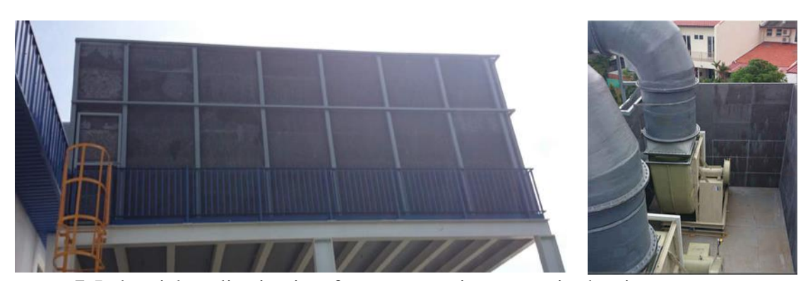
Figure 7. Industrial application in a factory extension as a noise barrier

In an extension project within a factory premise which is located about 15m away from a residential area, aluminum foam panels, weather-resistant, and lightweight were used as noise barriers. Installation and supervision of panels on a rooftop around the equipment resulted in the decline of noise levels at failed points.