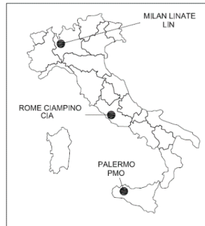
Fig. 3. Set of airport hubs chosen.

increased of 5 min at each airport to compute taxi-in/out time (the value has been increased to 10 min at Rome Fiumicino and Milan Malpensa to account for the complexity of the airside).