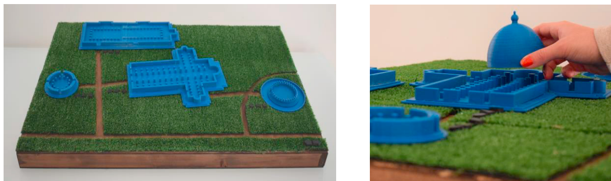
Fig. 1. Left: the model for Piazza dei Miracoli. Right: interaction with the cathedral dome

The device used to manage the interaction user-3D model is Raspberry PI 3, a single-board computer that is a few centimeters wide, with general purpose input/output capabilities. Raspberry is relatively inexpensive and is equipped with WiFi, Bluetooth and several IO pins. The wiring can be simplified using wireless speakers and activating the pull-up and pull-down internal resistors to implement various interaction modalities with the physical buttons. The software is based primarily on Python, is easy to use, and can be easily maintained and updated remotely via WiFi. It was thus possible to integrate Raspberry into the prototype, thereby reducing problems when moving and installing the prototype at the test site.