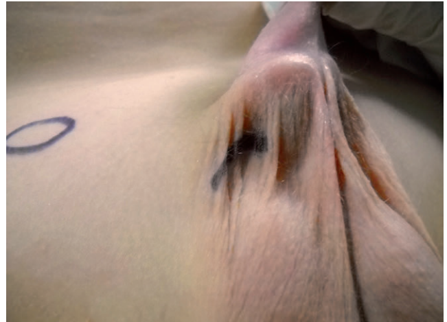
Figure 1. Eight-year-old boy with cryptorchidism: palpable undescended testes and scrotal incision shown.

Between January 2014 and June 2017 we performed prescrotal orchidopexy on 130 young boys, who were between 1 and 10 years of age (mean 4.6 years). Ten of the patients (7%) had bilateral cryptorchidism, 70 (54%) had a right cryptorchid testis, and 50 (38%) a left undescended testis, totalling 140 palpable testes. All of these testes were successfully moved down into the scrotum using a transscrotal approach in 138 of the 140 testes. The position of each testis was assessed at surgery: 22 (16%) were at the neck of the scrotum, 88 (63%) were at the external inguinal ring, 18 (13%) were at the lower side of the inguinal canal, and 12 (8%)