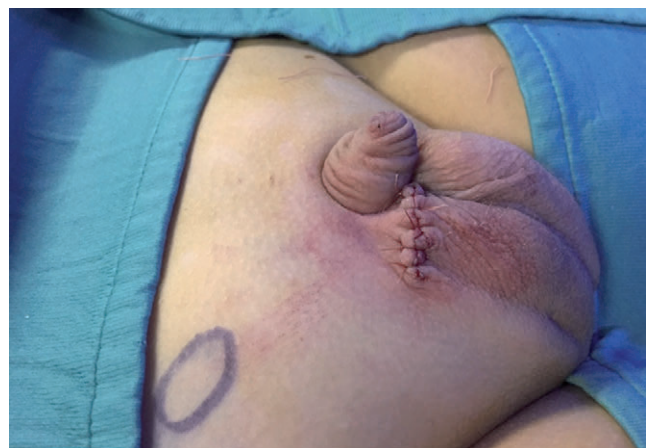
Figure 3. Resting position of testis after the procedure.