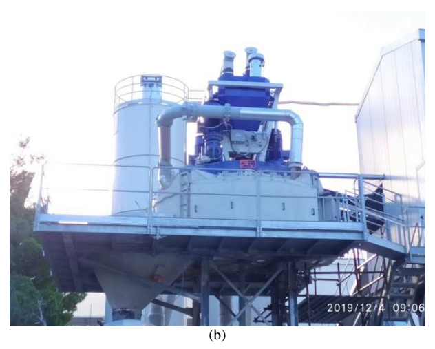
Fig. 3 TAFIPACC Implant: (a) scaled prototype; (b) complete system.