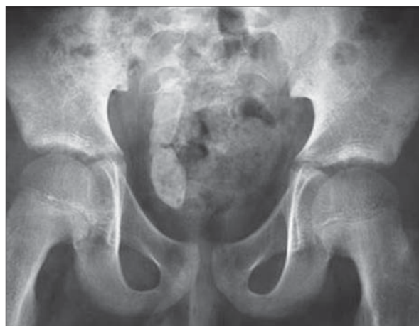
Figure 1: Plain abdominal x-ray: On the right side, the distal ureter is filled with radio-opaque stones

A 9 year-old boy referred for severe right hydronephrosis, recurrent pyelonephritis and urolithiasis. His history was uneventful until 4 years of age when he experienced episodes of unexplained recurrent fever treated with antibiotics. He then remained asymptomatic until the age of 8 when he was admitted to the local General Surgery Unit because of acute abdominal pain on the right iliac area. Initial appendicitis was diagnosed and treated with i.v. antibiotics. A few months later, he developed recurrent episodes of UTI and pyelonephritis with weight loss, anaemia and abdominal pain. The renal ultrasound and contrast CT-scan showed severe right hydronephrosis with enlarged kidney [Figure 1] and shaped distal urolithiasis, [Figure 2] with functional exclusion of the kidney. The cystography was negative