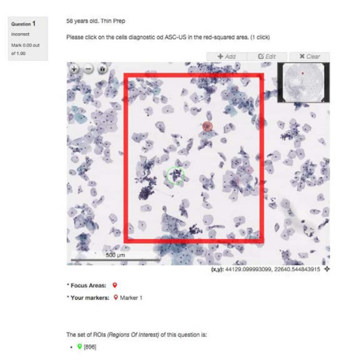
Fig.5 – Interactive question example: the correct answer is displayed as a feedback for the student

Fig. 4 - Interactive question example: the student answers the question adding a marker in the focus area inside the rectangle