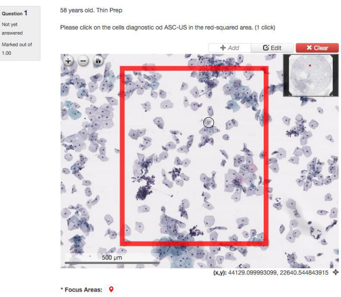
* Your markers: • Marker 1 ×

Fig. 4 - Interactive question example: the student answers the question adding a marker in the focus area inside the rectangle