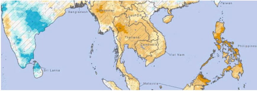
Fig. 9.1 Rainfall at end of June 2015: deficit ( brown ) and surplus ( blue ) (WFP 2015)

experiencing in recent years two extremes of water-related disasters, namely the 2011 floods and the ongoing drought started in 2014 that is causing severe water shortages issues across the country.