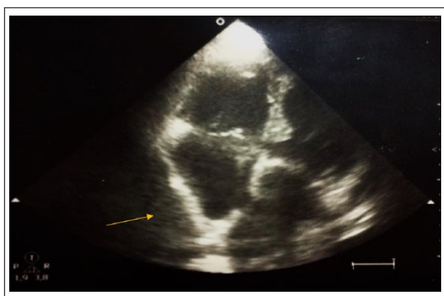
Figure 2. Bedside echocardiography picture showing accumulation of fluids (arrow) in the pericardial area indicative of cardiac tamponade.

RA: right atrium; RV: right ventricle; LA: left atrium; LV: left ventricle; PE: pericardial effusion.