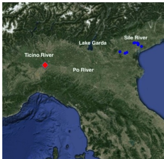
Figure 1. Actual distribution of G. roeselii in Northern Italy. Blue dots represent records in the Sile River basin (Ruffo and Stoch 2005); red rhombus indicates the new record in the Ticino River basin (Gaviola stream: N 45°11'27.4"; E 09°04'03.7").

semi-natural areas such as ponds, oxbow lakes and small streams, which are often used as fish repopulation areas.