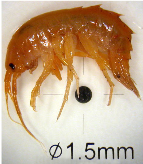
Figure 2. Specimen of Gammarus roeselii collected in the Gaviola stream.