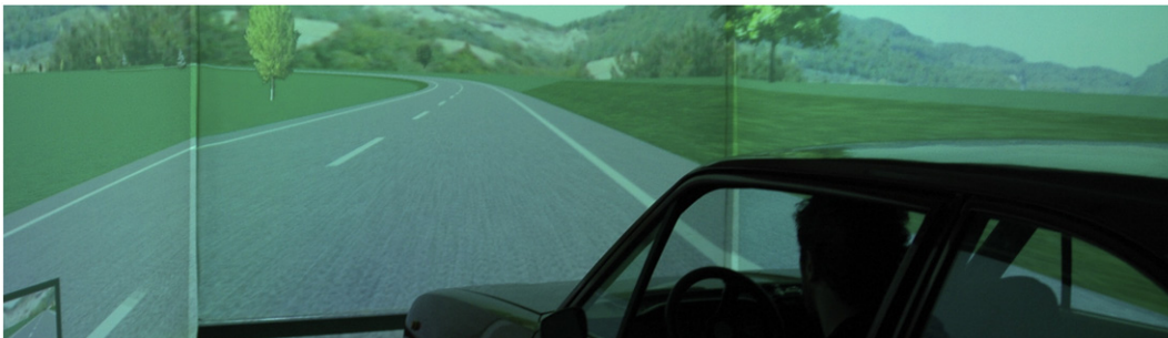
Fig. 2. Driving phase from the simulator.

Table 2 shows a summary of the mean values of the measures V_T , V_C and MSR and their standard deviations for the 6 studied curves.