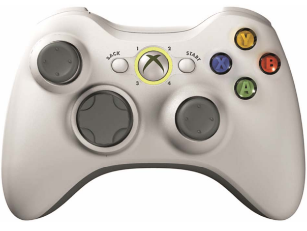
Figure 2. The joypad Xbox 360.

The human players must avoid the rendez vous with the three automated players (the predators) and must reach a given location in the plane called preys' home. The preys' home is represented by a brown disk with a yellow center on the computer screen. The game field is the entire plane and each prey has at its disposal a window on the computer screen (see Figure 1 ). During the game each prey is always at the center of its window. That is the window scrolls up, down, left and right according to the movement of the prey. In every window in the right top corner there is a global view of the game scene provided by the "radar" of the prey. This global view of the scene has the prey at its center and shows all the actors of the game and the preys' home. Finally in the left bottom corner of every window there is an arrow that indicates