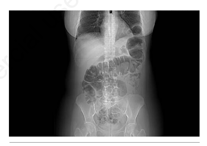
Figure 1. Preoperative abdominal standard X-ray showing the left colonic flexure herniation and intestinal enlargement of small bowel and right colon.