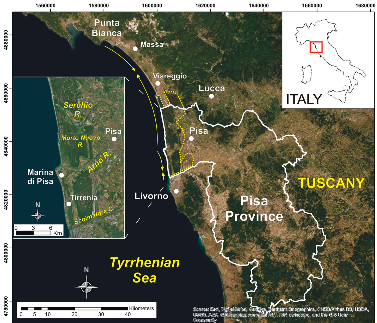
Figure 1. Location map of the study area. The yellow lines represent the direction of the littoral drifts along the Northern Tuscany littoral cell. The yellow dotted line outlines the area belonging to the Migliarino – San Rossore – Massaciuccoli Regional Park.

website (Tuscany Region geo-portal) allowed the employment of a detailed Digital Terrain Model (DTM) of the study area as source data for map construction/realization. The LASER (Light Amplification by the Stimulated Emission of Radiation) scanner acquisition enables the production of Digital Elevation Model (DEM) even of the 'bare' ground surface (DTM), in which any other feature lying on the terrain (e.g. trees, building, etc.) has been removed. The use of DTM rather than DEM is essential for morphologic investigation, especially in densely vegetated areas as in the case of the Arno River delta. LiDAR data (i.e. x,y,z points cloud) that produced the DEM used in this work have been acquired with a LASER airborne survey between 2008 and 2009 by MATTM (Ministero dell'Ambiente e della Tutela del Territorio e del Mare). DEMs provided from MATTM display 1 \times 1 m or 2 \times 2 m ground resolutions and planimetric and altimetric accuracy of \pm 30 cm and \pm 15 cm, respectively. Enhancement techniques were applied within GIS environment to the LiDAR DTM raster visualization in order to obtain