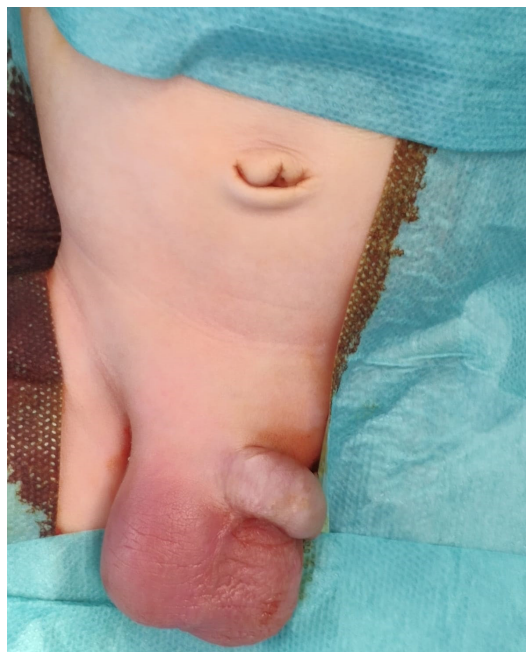
Figure 1 Erythema and swelling of the right hemiscrotum.

Amyand hernia consists of the presence of the vermiform appendix in an inguinal