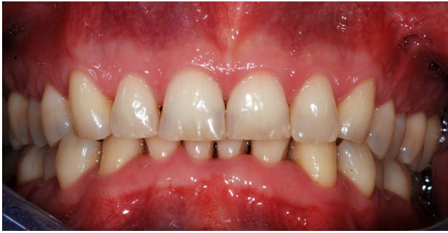
FIGURE 4 Clinical image of the patient at first visit