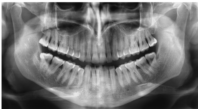
FIGURE 2 Orthopantomogram X-ray in 2010 after the onset of the brain abscess

After 7 years, in 2017, the patient's systemic and periodontal health were good. In the tested sites probing depth