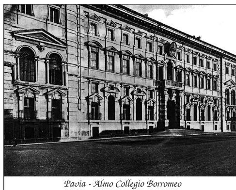
Pavia - Almo Collegio Borromeo