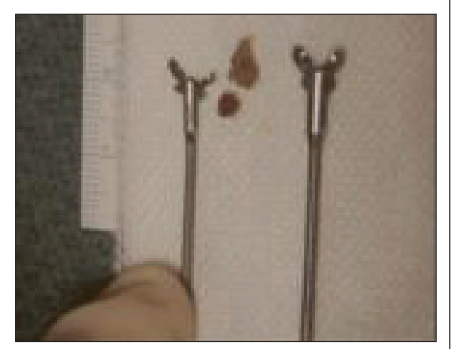
Fig. 1. - Difference between big bioptic forceps on the right (Jumbo forceps) used via rigid bronchoscope with a lung sample that is poured out of the tip of the forceps and standard flexible bioptic forceps for fiber-bronchoscope.

A total of 95 patients underwent TBLB via rigid bronchoscope for evaluation of DPLD during the time period of this study. The baseline characteristics and lung function parameters of patients are shown in table 1. Diagnostic yield of TBLB using Jumbo forceps was significantly higher than using normal flexible forceps via rigid bronchoscopy in patients with diffuse parenchymal lung disease (DPLD) (p = 0.001). In 74 out of 95 patients (78%) the diagnosis was placed with Jumbo forcep while the smaller forcep was diagnostic in 62 out of 95 patients (65%). Large forceps obtained significantly more tissue than did small forceps; the biopsy specimen taken with normal forcep measured in average 1.4 x 1.0 mm and the larger biopsy taken with jumbo forcep measured in average 2.5 x 1.9 mm (p < 0.005,). TBLB had a high diagnostic yield in disorders that significantly involve terminal and