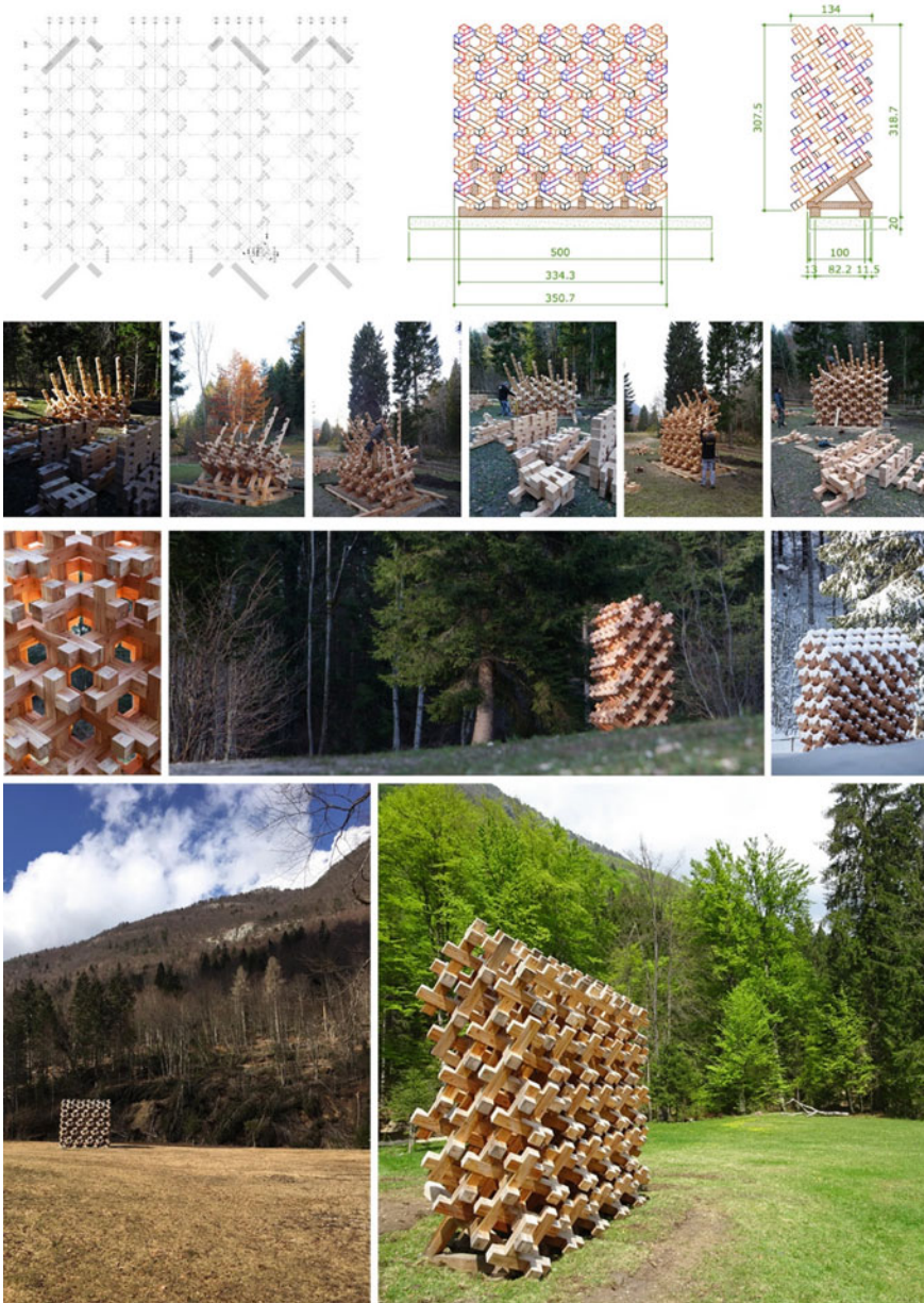
Fig. 2 Forest Byobu design definition ( drawings credit Galloppini Legnami and Politecnico di Milano) and assembling phases ( credit Politecnico di Milano), up to the final complete structure, a geometric pattern contrasting the natural landscape of its location at Arte Sella, the Contemporary Mountain ( credits for the first row, Ph. Giacomo Bianchi for Arte Sella; for the latter, Politecnico di Milano)