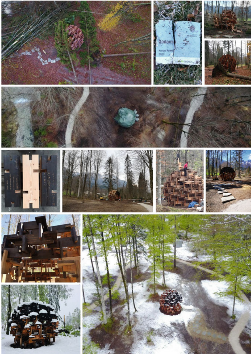
Fig. 6 Kodama 2.0 is the Arte Sella pavilion refurbishment damaged during the devastating storm of October 2018: the structure has been (i) protected to retain the humidity content of wood elements before restoration; (ii) new pieces have been cut via CNC machine, (iii) burned and carved to render a Japanese haiku on the surface, and (iv) relocated to its original location, obtaining a new aesthetic for the wooden lattice ( credit Politecnico di Milano and Arte Sella)