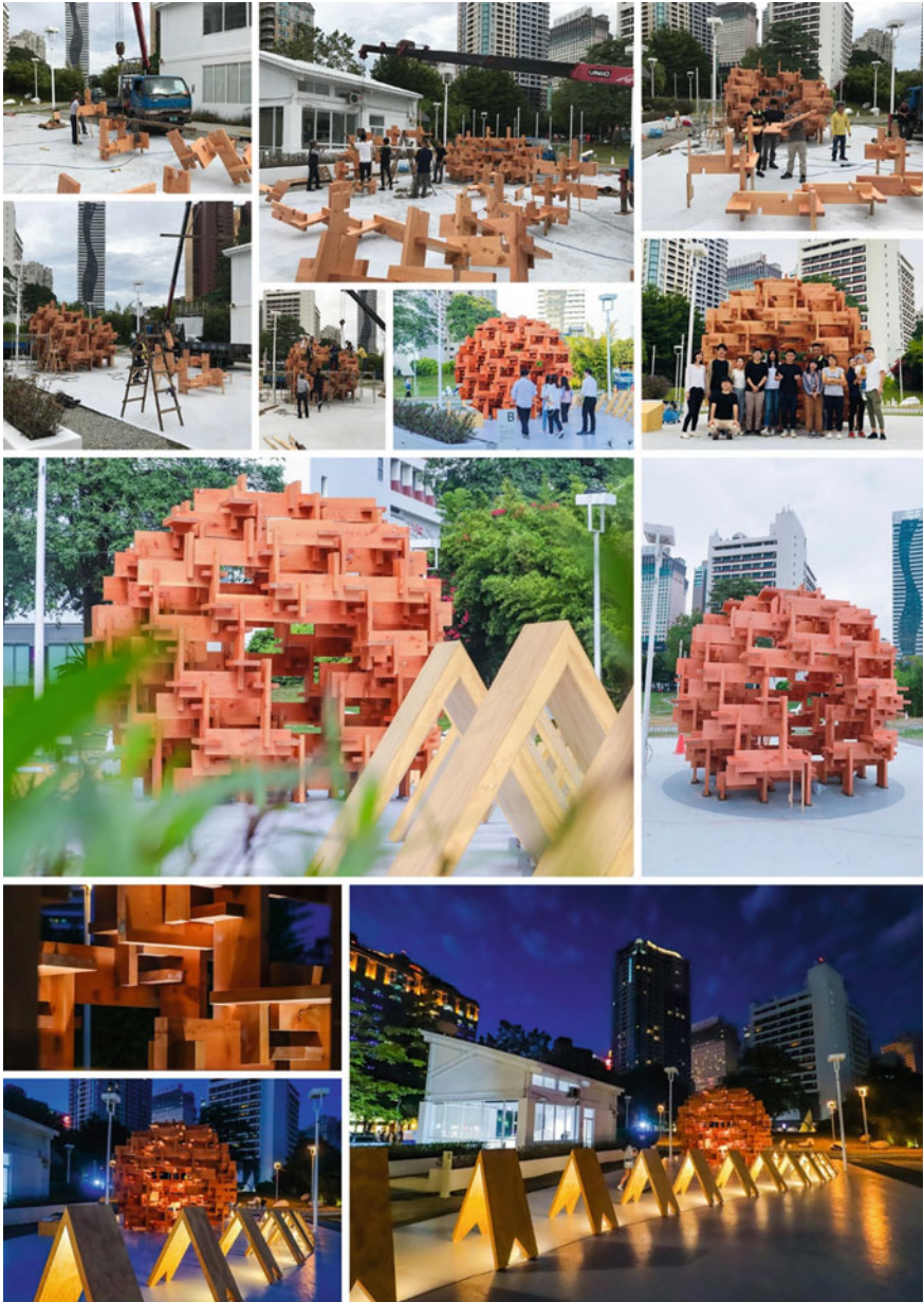
Fig. 5 The Taiwanese sample of Kodama Pavilion realized, accounting for the same digitalized processes of design and production, by Kengo Kuma Lab in 2018