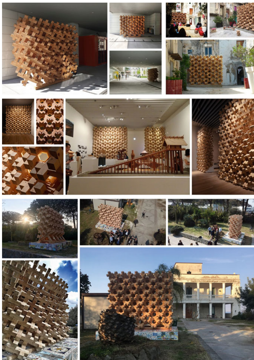
Fig. 3 The Byobu experiences. Above to the left, the University Byobu in Politecnico di Milano—Lecco campus and, to the right, the Urban Byobu at FARM Cultural Park, Favara ; in the middle, the Kigumi Infinity Byobu at Mori Museum of Tokyo ; and finally the one on the island of Ischia