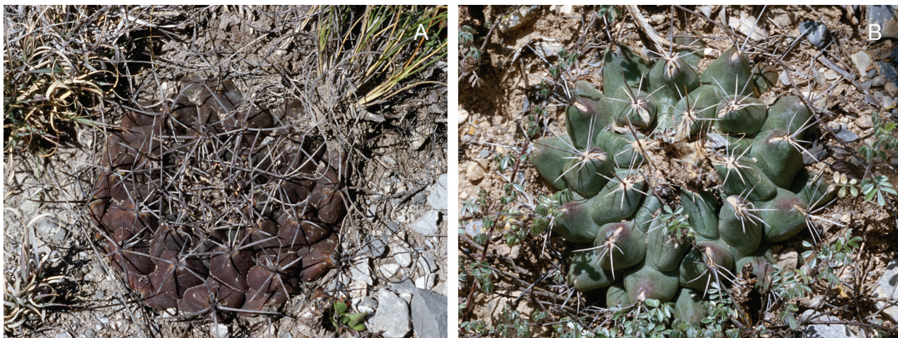
Figure 1. Thelocactus buekii in Nuevo León, Mexico. A), Thelocactus buekii photographed in March, during the dry season, showing a dark reddish stem due to accumulation of betacyanins. B), Thelocactus buekii photographed at the end of the rainy season, in September. The stem is green with only tubercle tips showing a reddish colour.