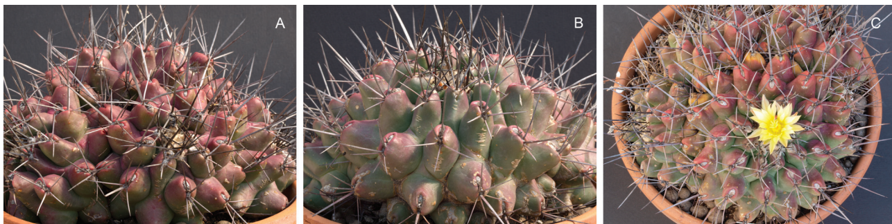
Figure 2. Thelocactus conothelos ssp. flavus in cultivation. A), the south facing side of the plant showing a deep red colouration of the stem as a result of betacyanin accumulation in response to high irradiation. B), the north facing side of the same plant that is greener in colour due to the less exposure to the sun. C), top view of the specimen. The difference in pigmentation between south and north facing sides is evident.

was uniseriate, while the hypodermis had 1 or 2 layers of thick-walled cells. Betacyanins were mainly present in the outermost layers of the cortical chlorenchyma, while only few cells of the hypodermis were pigmented (Table 2). Crystals or druses were not observed in this species (Fig. 4B). Obregonia denegrii showed a thin epidermis,