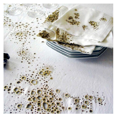
Figure 5. Disobeying aesthetical rules: semantic values (Mezzadro by Achille and Pier Giacomo Castiglioni, designed in 1957 and produced by Zanotta in 1971), perfection (Coffee and Cigarette by Julie Krakowski, autoproduction, 2006).