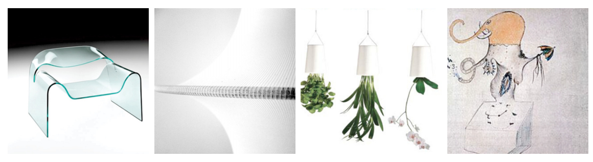
Figure 3. Disobeying technical-functional rules: from left materials (Ghost armchair by Cini Boeri and Tomu Katayanagi, produced by Fiam Italia, 1987 and Falkland lamp by Bruno Munari, produced by Danese, 1964), gravity (Sky planter designed by Patrick Morris, produced by Boskke, 2008), linearity of the process ( Cadavre exquis by Man Ray, Joan Miró, Max Morise and Yves Tanguy).

In this area, relative to the scale of object only, we can have, i.e., the transgression of common semantic values and used metaphors, of the temporal dimension, the transgression of perfection (giving to the unfinished, imperfect and incomplete the right of object).