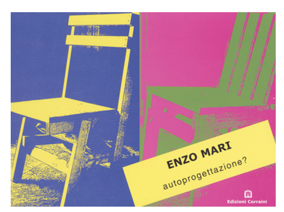
Figure 4. Disobeying socio-economic rules: context (Enzo Mari is the author of the book Autoprogettazione? Published by Corraini, Mantova, in 2002).