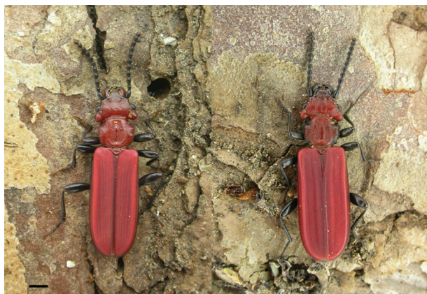
Figure 1. Cucujus haematodes (left) and C. cinnaberinus (right) adults. Scale bar: 1 mm.

There is little data on the food preferences of either adults or larvae of these beetles, and that which is available is still unclear. Smith and Sears