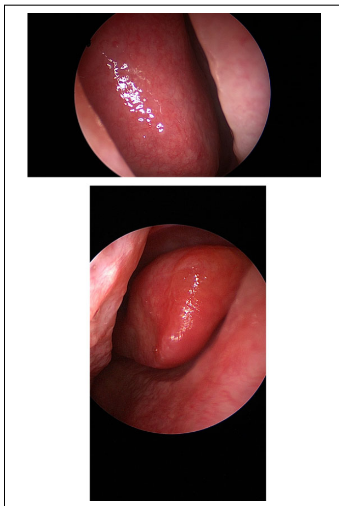
Figures 3. Intraoperative view of the nasal septum mucosa and middle meatus before surgery; representative patient belonging to control group.

Moreover, epistaxis is another common adverse effect of INC use, with a reported incidence between 17% and 23%. 27