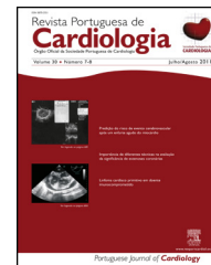
IMAGE IN CARDIOLOGY