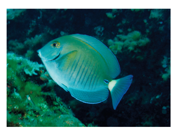
Fig. 1: The individual of Acanthurus chirurgus (~10 cm TL) observed at Elba Island on July 20, 2012 (Photo by M. Boyer).

body with a whitish ring on the caudal peduncle, and the characteristic 10 dark gray vertical bars on the posterior part of the flank reaching neither the dorsal nor the ventral edge. The unpaired fins show a thin but marked blue edge, and the dorsal and anal fins show several faint, oblique darker stripes. The peduncular spine shows a noticeable bright blue margin. This combination of characteristics allowed us to identify it univocally as A. chirurgus (Kuiter & Debelius, 2001). The fish was a young individual, about 10 cm TL, and appeared to be in good health.