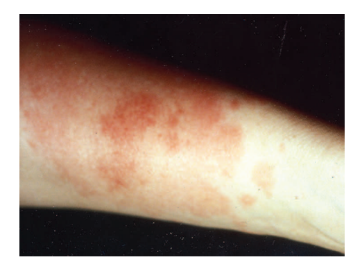
Fig. 3. Wheals arising on an erythematous base were noted on the flexor surface of the right forearm.

An open test was performed on the flexor surface of the left forearm with the Rhus toxicodendron tincture