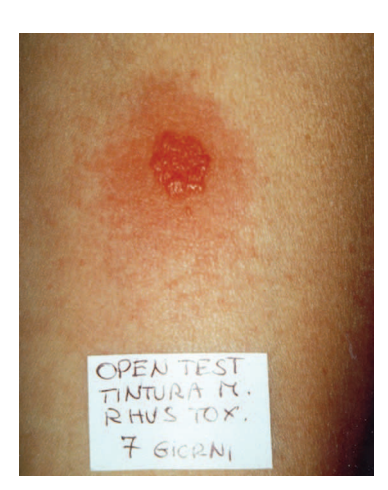
Fig. 4. Open test with Rhus toxicodendron tincture 7 days after application.

as it was. At the site of application we observed an erythemato-oedematous response at 48 h, and an vesicular reaction at 96 h that was still present after 7 days (Fig. 4). Patch test with ethyl alcohol 65% gave negative results. As control, an open test was performed in eight healthy subjects revealing negative responses to the application of Rhus tincture.