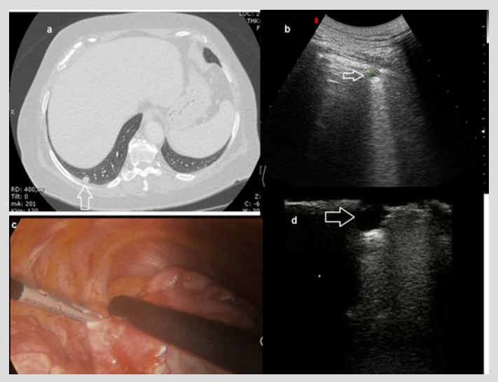
Figure 3: a) a CT axial scan image and b) an TUS scan with convex probe (5 MHz) of a patient with pulmonary micro nodule in the posterior basal segment of the right lung (white arrow); c and d) ILU (intraoperative linear probe) showing an hypoechoic structure and well delimited margins of the left micro nodule (white arrow).

Several authors studied a possible role of B-lines in the early detection of ILDs, especially when associated with autoimmune disorders [13,14]. The generation of ring-down artifacts is dependent on several factors, including the interaction between the chest wall, the air in the lung and even a small, non-detectable, pleural effusion [1,12]. The machine setting, the kind of probe used (i.e. convex, linear or phased-array) and the frequency strongly influence the generation and the number of rings down (or B-lines) artifacts [1,11]. We performed ILU in patients with Systemic Sclerosis-related ILD, Usual Interstitial Pneumonia (UIP) Chest-Computed Tomography (CT) pattern and Non-Specific Interstitial Pneumonia (NSIP) CT pattern [8]. The main finding is an increased thickness of the interface between the probe and the lung parenchyma, with no artifacts beyond it (Figure 2d & 2e). The ILU images highlight and confirm that ILDs should not be suspected by TUS B-lines count, as also stated previously [15,16]. On the other hand, the increased thickness of the hyperechoic pleural line should be considered as a "ringing bell" for ILD and lead the physician to ask for a chest HRCT scan [17].