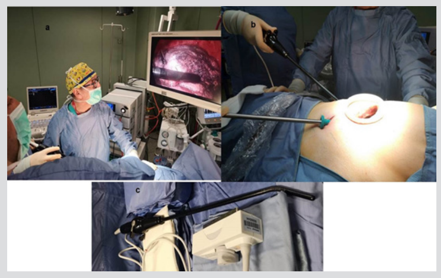
Figure 1: ILU technique:

along the posterior, middle and anterior axillary line. The anterior chest has been evaluated with midclavicular and parasternal scans. Videoclip of TUS scans were viewed by two expert sonographers, in a double-blind way; also, thoracic CT imaging were checked by two expert radiologist, in a double-blind way as well. In this short communication, we discuss the US semeiotics comparing TUS and ILU findings in normal lung, in Interstitial Lung Diseases (ILDs) and in lung nodules, interpreting the images according the ultrasound physics principles.