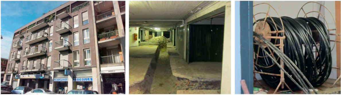
Fig. 1. (a) Façade of the residential building; (b) garage plant with the excavation to install the probes; (c) probes used in the project.