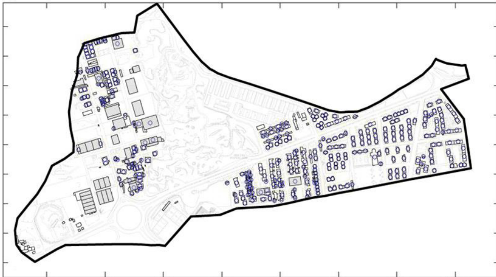
Fig. 1. Modeled urban area

Particularly, configurations 1, 2 and 3 corresponds to a fixed percentage of energy generation that is respectively the 35, 45 and 50% of the total energy demand of the network. Each building has a generation capacity that depends on its roof's area. The modeled urban area is shown in Figure 1, where blue circles represents the nodes, in this specific case, the buildings.