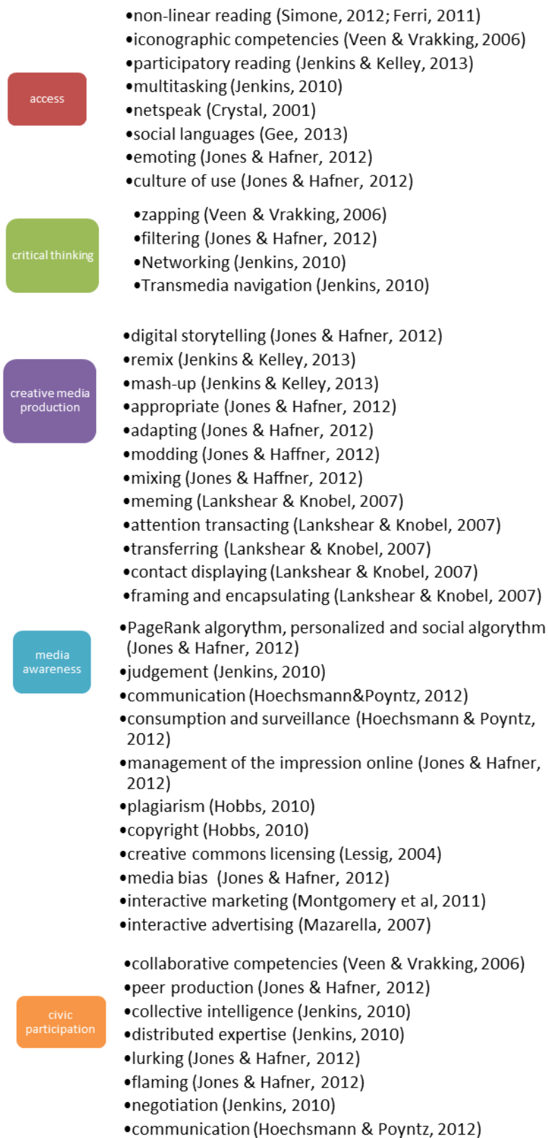
Figure 1. The map of digital competences.

attention to it by sharing it with the greatest number of people possible.