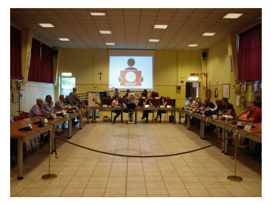
Fig. 11.1 Public meetings with the engaged stakeholders