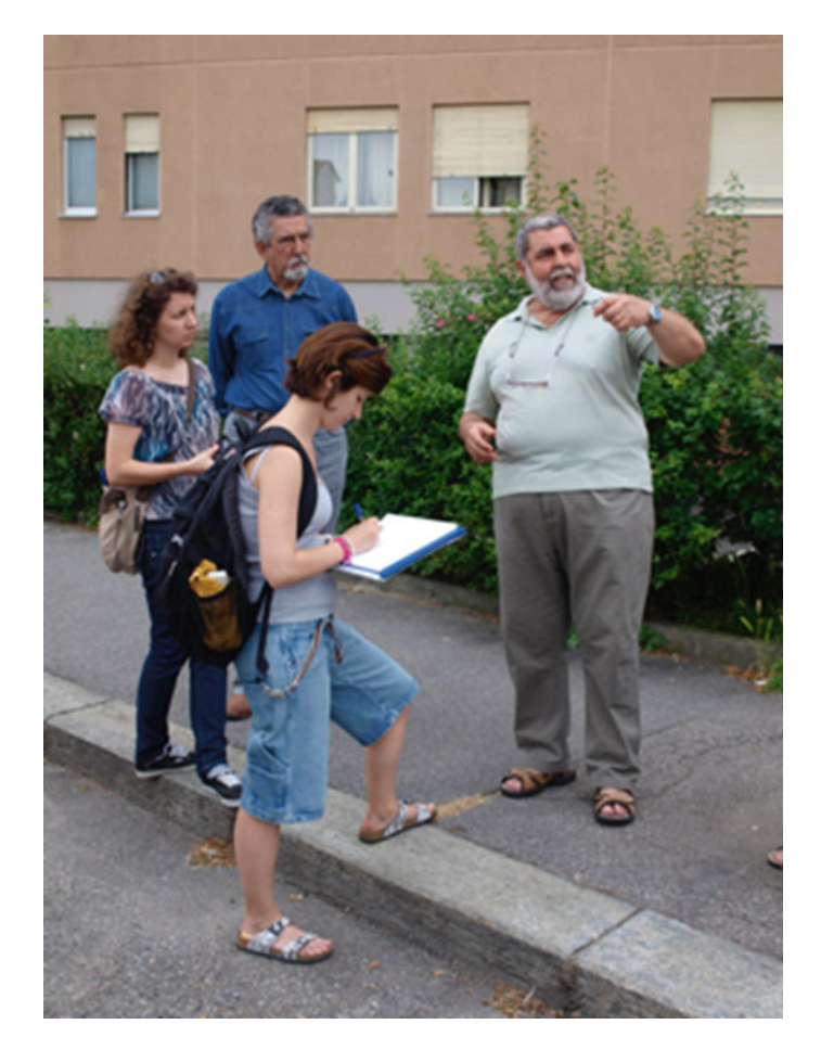
Fig. 11.3 Data collection with the community (transect walks)

requirements specification. In particular, in order to ensure the tool compliance and integration into the current administrative process, the managing executives and the public officers have been involved in each step in co-creating and testing the technological platform.