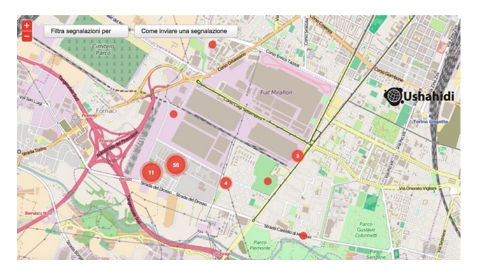
Fig. 11.2 Crowdmapping reports on the web-based map provided by Ushahidi

which might not always be available. That was an essential element for the implementation of the project in order to achieve social inclusiveness by providing the possibility to report from any kind of mobile device. Outcomes of data collection were published to make them accessible to the local authorities. In the meanwhile, an analysis of data was needed, in order to understand the weak points and to further discuss with people, and so a plan of activities, such as traditional meetings to transect walks, was set up (De Filippi et al. 2017a). This process was important to enhance public participation, involving people from the first to the last step (Fig. 11.3).