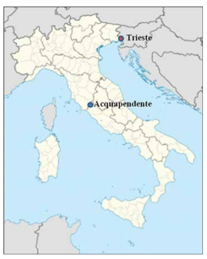
Figure 1. Geographical location of Acquapendente (42°44'41"N, 11°51'54"E, Viterbo) (blue spot), the little town located in the north part of the Lazio, on the border with Umbria and Tuscany (central Italy) where cats no. 1 and 2 were born and lived until the adoption (http://i.wikipedia.org/wiki/Acquapendente). Geographical location of Trieste (red spot), the town where an endemic focus of Cytauxzoon sp. infection was described.

Deoxyribonucleic acid (DNA) extraction was performed from Ethylendiaminetetracetic acid blood by the High Pure Polymerase Chain Reaction (PCR) Template Preparation Kit (Roche Applied Science, Mannheim, Germany) in accordance with the manufacturer's protocol with some modifications (7). A fragment of the 18S rRNA gene of Piroplasmidae species of approximately 412 base pair (bp) was amplified by conventional PCR (7). Then, positive PCR samples were directly sequenced. The sequencing was performed by an Applied Biosystem 3730xl DNA Analyzer (Applied Biosystem, Carlsbad, California) on both strands by BMR Genomics srl (Padua, Italy) by using the dideoxy chain-termination method (8). The consensus sequence was compared to the sequences deposited in GenBank<sup>®</sup> using the basin local