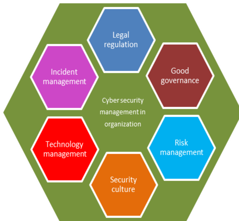
Fig. 2. Cyber security management model

Further on we will provide the cyber security management module which can be used to ensure security to any critical infrastructure as well as to improve the cyber security of any business company or government organization. However, we will not concentrate on usage of concrete technology equipment or information security management processes that are used for making critical infrastructure safer, but will provide core information about the proposed model. The whole model is presented in Fig. 2.