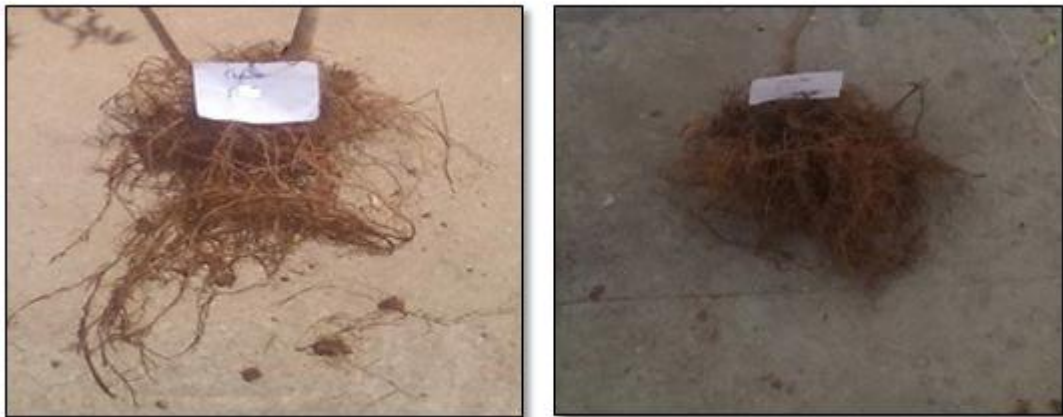
Fig. 1. Root density of 'Chemlali' plants irrigated with TW (a) and TWW (b). TW= irrigated trees with tap water; TWW=irrigated trees with treated wastewater.

[33] Y.J. Lee, C.M. Yang, K.W. Chang, Y. Shen, Effects of nitrogen status on leaf anatomy, chlorophyll content and canopy reflectance of paddy rice, Bot. Stud. 52 (2011) 295-303.