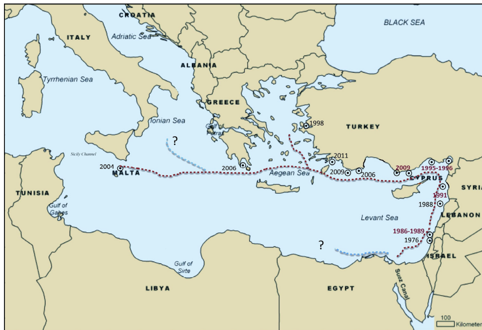
Figure 3. Hypothesized expansion route taken by Rhopilema nomadica throughout the Mediterranean Sea to date. Key: red years, records of outbreaks; black years: records of few individuals. Supporting information to the records reported in this figure is given in Table 1.

study may not necessarily contradict such a hypothesis as drifting jellyfish may reach the entrance to Western Mediterranean, but the full completion of the R. nomadica life cycle may be prevented by the low winter temperatures affecting scyphistoma or podocyst stages survival.