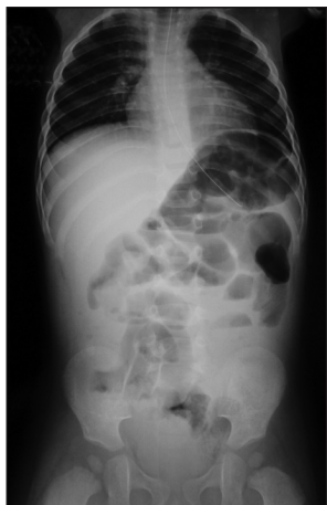
Figure 1: The anteroposterior sitting X-ray showing bowel meteoric distension showing some air fluid levels in central and left quadrants of the abdomen and accentuation of vascular hilar and perihilar pulmonary markings without signs of consolidation

Subsequently, the patient underwent abdominal ultrasounds that raised the suspicion of an appendicular phlegmon. A decision was made to proceed for a surgical exploration via a transverse supra-umbilical laparotomy. Entering the peritoneal cavity, free purulent material was encountered and the caecum was found in the right iliac fossa. A gangrenous appendix was removed, multiple intra-abdominal abscesses (sub-hepatic, sub-diaphragmatic and pelvic) were drained and an extensive peritoneal washing was carried out [Figure 2]. Postoperatively, patient was given a seven-day treatment with intravenous Ceftriaxone 750 mg/die and Metronidazole 240 mg/die. On day four, he was started an enteral feeding. The post-operative course has been unremarkable and the child was discharged on day 8 post-operative from our department without any pharmacologic therapy. On the follow-up controls, at 7 and 30 days, the baby was fine.