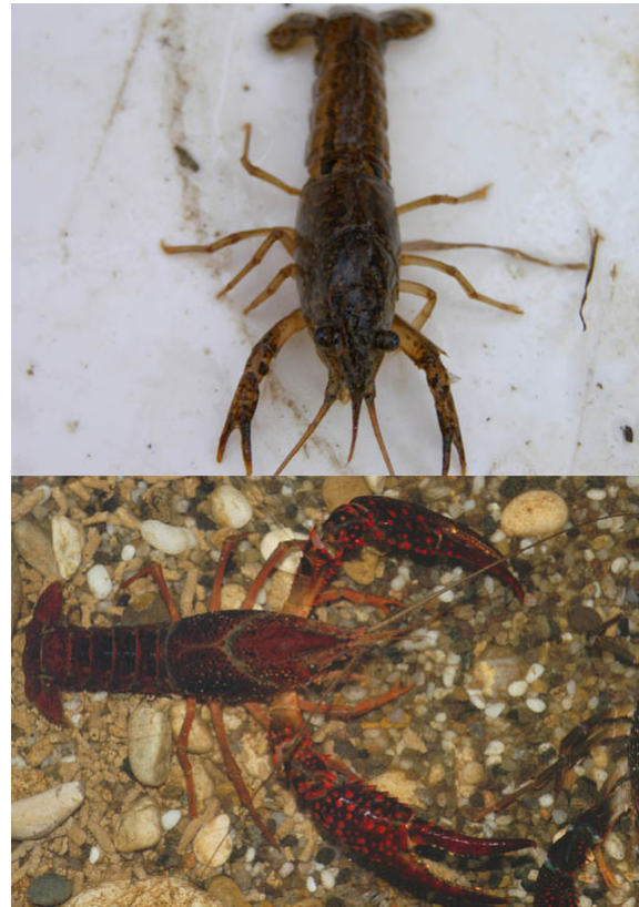
Figure 1. First record of marbled crayfish Procambarus sp. collected in Central Italy during spring 2008 (top). Comparison with Procambarus clarkii (bottom)

A total of 20 crayfish of uncertain morphology were selected among more than 100 crayfish collected by electrofishing and traps. Sampling was carried out on May 8 and July 29, 2008 in 2000 m 2 (channel width: 2 m). Crayfish were