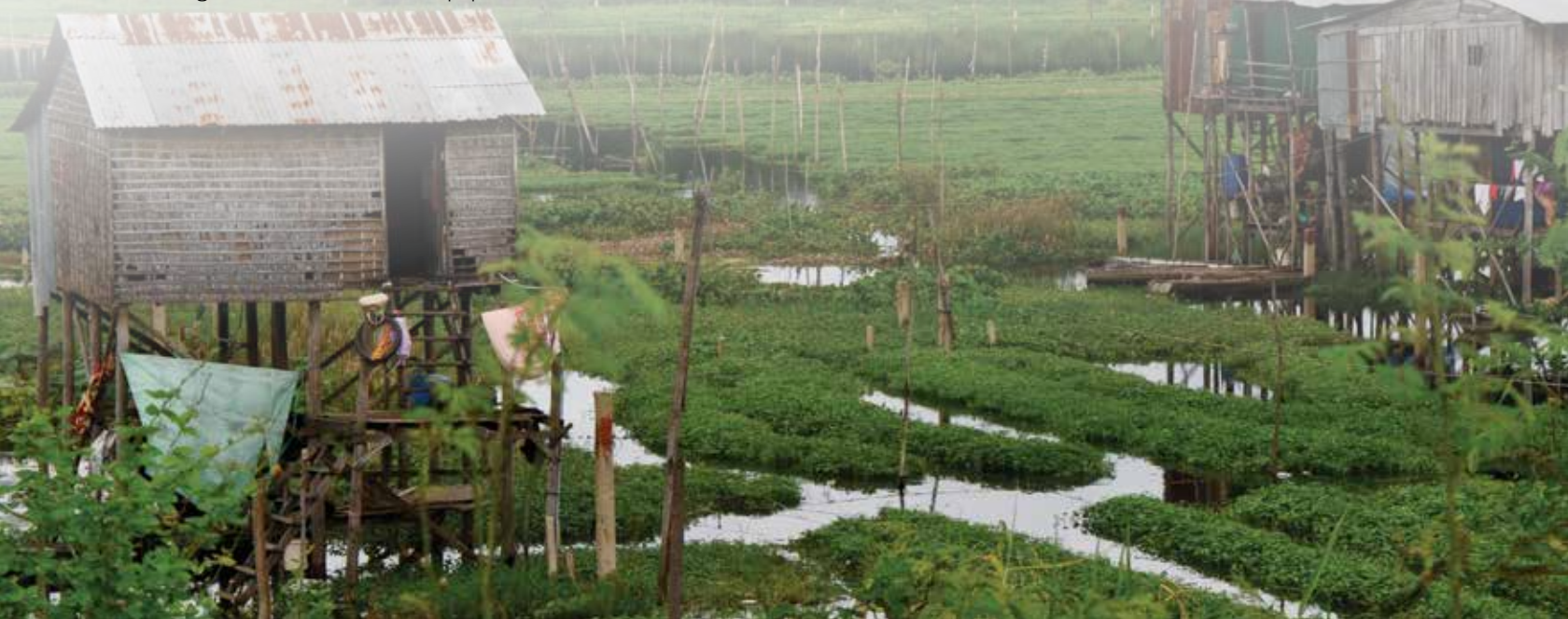
A rural village on the outskirts of the Cambodian capital, located several miles from the infamous killing fields. Houses are constructed on stilts to protect them from flooding, especially during the monsoon season.