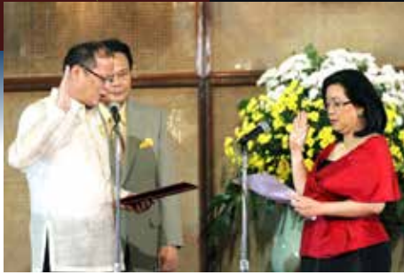
Maria Lourdes P. Sereno, LLM '93, is sworn in as a justice of the Supreme Court of the Philippines (left). Professor Susanne Baer, LLM '93, lectures at the U-M Law School (below).