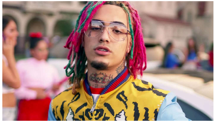
THE GENIUS LIL PUMP (VULTURE)

His hits didn't stop there. Later in 2016, "Feel Like Ouu" was released. In "Feel Like Ouu," "Left four bands in the trap (Four)." (Slang for $1,000 is a "band.") Pump may have meant to leave $4000 in the trap for his friends to use, spend $4000 on drugs or other items purchased in the trap, or he may have simply forgotten his $4000 in the trap and not cared. After all, $4000 is nothing in comparison to what Pump makes on average, "Made a couple bands in the kitchen (Kitchen)." Pump asserts that he can cook up narcotics like crack cocaine, which he then sells to make considerable amounts of money. This has earned him the honorable occupation of a street pharmacist. "Walk in the club and I