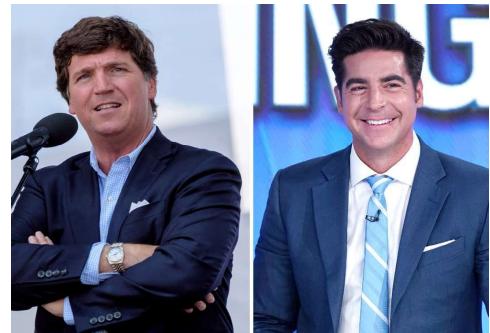
(LEFT) TUCKER CARLSON (RIGHT) JESSE WATTERS

Required texts for the course include Andrew Jackson's inauguration speech, the Ronald Reagan autobiography, all of Trump's Twitter , and Mein Kampf .