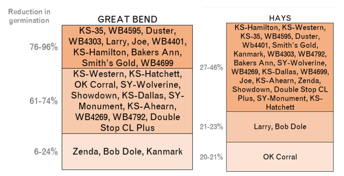
Figure 3. Percent reduction in Palmer amaranth seed germination relative to the control as impacted by the significant interaction between 25 winter wheat varieties and two locations (Great Bend, left; and Hays, right) following the 2022 winter wheat growing season. Wheat varieties placed within the highest or the lowest groups did not differ statistically from each other according to the Tukey's test at P < 0.05.