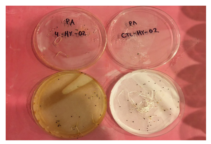
Figure 1. Palmer amaranth seed germination after 5 days for the wheat variety Duster (left) versus the de-ionized water control (right).