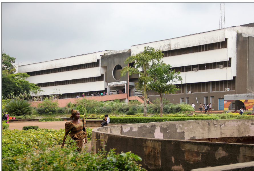
Figure 1: Ife Campus, Nigeria. Still from Zvi Efrat's documentary, Scenes from the Most Beautiful Campus in Africa , created as part of Bauhaus Imaginista , 2019.

The answer proved to be to move sideways, in an enormously ambitious global history project entitled Bauhaus Imaginista and curated by Marion von Osten and Grant Watson, which no longer focused on the school itself but on parallel developments around the world and the Bauhaus's sometimes tenuous relationship to them ( Figure 1 ). The material featured in those exhibitions