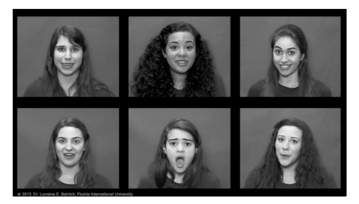
Figure 0-1. Static image of the dynamic audiovisual social events from the IPEP. On each trial, all six women are shown speaking while the natural and synchronous soundtrack to only one of them is heard. accompanying the videos is synchronized with one of the six women.