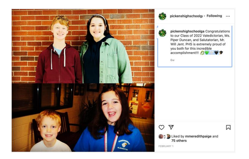
Fig. 1. Pickens High School [@pickenshighschoolga]. Pictures of Pickens High School's 2022 valedictorian and salutatorian. Instagram.

The Pickens High School pages on both Instagram and Facebook serve as further evidence of the use of social media by different generations. The school recently posted on both pages, with both posts containing similar information. The post on Instagram, fig. 1, contains a