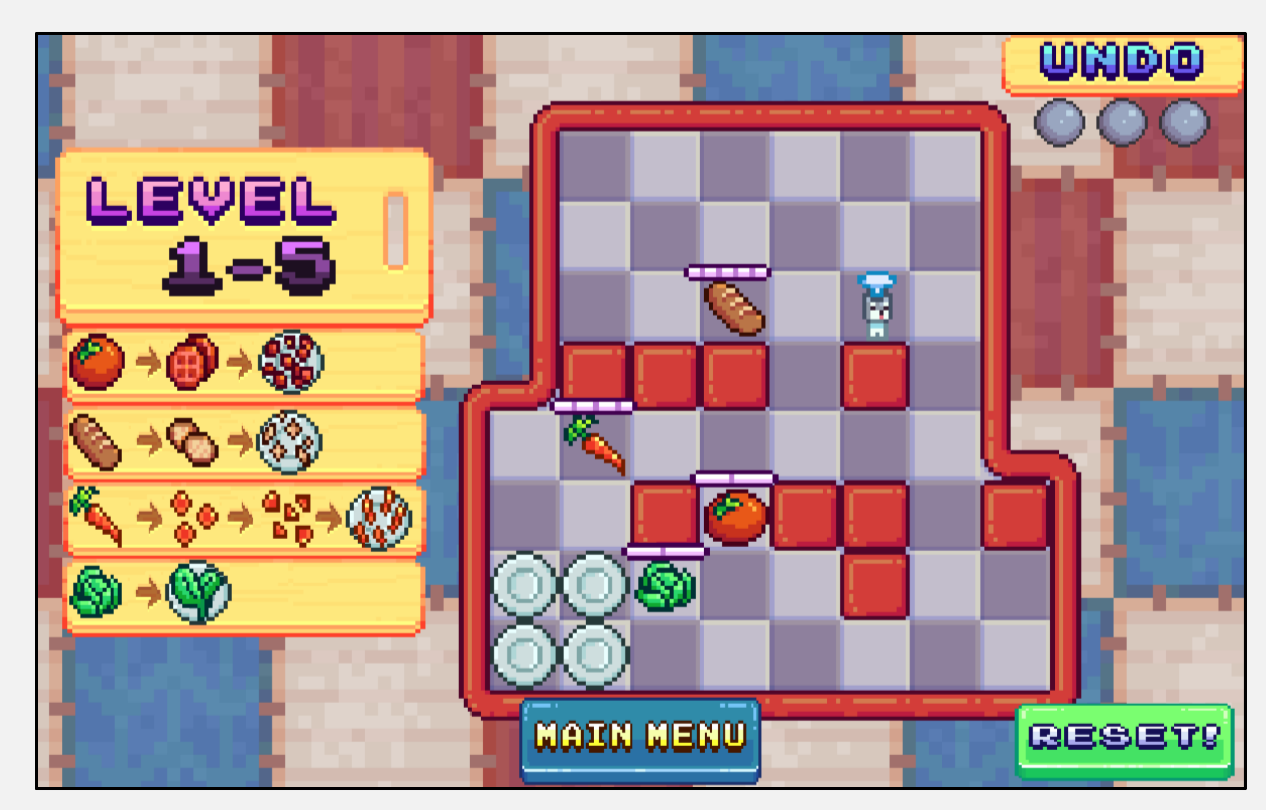
Fig.1 Screenshot of the fifth level in the first set of levels.