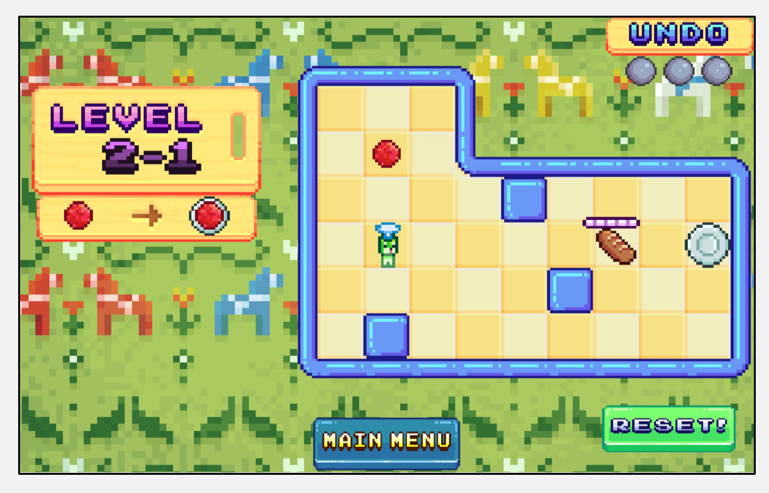
Fig.3 Screenshot of the level where meatballs, which roll until they hit an obstacle, were introduced.

Fig.1 Screenshot of the fifth level in the first set of levels.