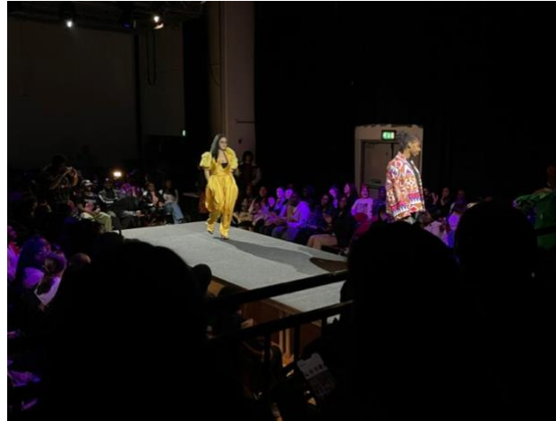
ACS's fashion show

ACS hosts both weekly meetings as well as large-scale public events. The event I attended was their fashion show, which showcased clothing designed by African and Caribbean designers and featured music performances in the breaks between when the models walked.