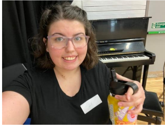
Me at auditions

International Student Society hosts events catered towards international students, both those like me who are visiting for a semester, as well as long term international students. They organized a bus tour to explore the Connemara region north of Galway and it was an amazing trip. We stopped in the village of Cong – famous for being the place where John Wayne filmed The Quiet Man – and Kylemore Abbey, an absolutely beautiful castle turned Abbey that doubles as a museum/tourist destination.