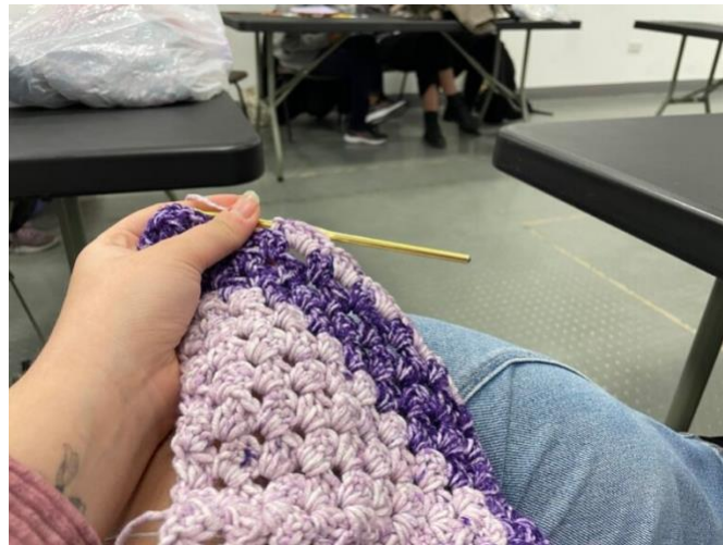
Working on a crochet project at Granny soc

Granny Soc hosts events themed around crafting, and offers weekly knitting, crochet, or sewing. lessons, as well as meetings to bring your own projects to.