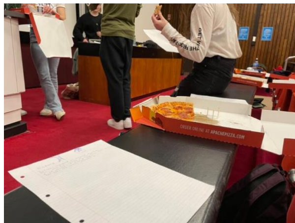
Post-meeting pizza at Lit & Deb! Our workshop of the day was “Frankenstein poems”, where each person completes a different line of the poem.

Lit & Deb functions similarly to the speech and debate program back at Linfield (which I happen to be a member of), so I immediately knew I wanted to get involved. Over the course of the semester I attended weekly public speaking workshops and debate events, culminating in an end of year party the last week of classes.