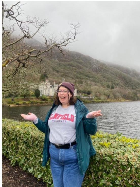
Posing with the Abbey

International Student Society hosts events catered towards international students, both those like me who are visiting for a semester, as well as long term international students. They organized a bus tour to explore the Connemara region north of Galway and it was an amazing trip. We stopped in the village of Cong – famous for being the place where John Wayne filmed The Quiet Man – and Kylemore Abbey, an absolutely beautiful castle turned Abbey that doubles as a museum/tourist destination.