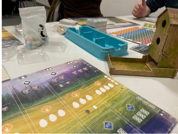
Trying (and failing) to learn how to play Wingspan.

The moral of this post is that there are so many ways to get involved on campus, and your level of involvement in any society could be as little as attending one event a semester or as big as going weekly and taking up a leadership role in the society. Especially going from a smaller university with a limited amount of clubs to one with over 60, there were so many more options when it came to getting involved on campus. Getting involved allowed me to explore new places, meet new people, and try new things. While it may not be as exciting as a travel post, I hope you enjoy this glimpse into my everyday life as a university student in Ireland these past few months 😊