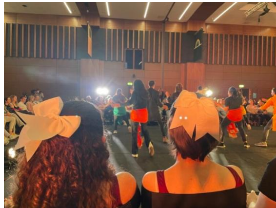
Dance showcase! Performers could watch for free, but we also got the seats facing the back of the performance space.

GUMS holds auditions for about two musical productions a semester. I auditioned for both, and, while I ultimately wasn't cast, the audition process was still a lot of fun both times.