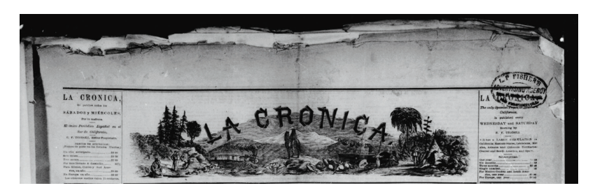
Figure 3. La Crónica's new title flag of June 23, 1875.

The major change to the paper's layout in 1875 offers a useful provocation in the visual terms set by Newspaper Navigator. On June 23, 1875, La Crónica debuted an elaborate title flag image, replacing what was already brand-new type with a multifaceted representation of Manifest Destiny arriving to California (fig. 3).<sup>39</sup> The image endured for as long as Chronicling America includes this title. This visual rebranding of the newspaper is accompanied by a change in local status. On June 19, the designation "Periodico Oficial/City Oficial Paper" begins to appear on the top of page 2. Newspaper Navigator, however, groups the 1875 issues with the preceding years because it analyzes seven different visual elements on the page, in effect deemphasizing what would otherwise be a decisive format change. This paradox—wherein a sizable visual shift is subsumed into a larger relational pattern—is characteristic of Newspaper Navigator's particular reading affordances. In effect, Newspaper Navigator challenges us to imagine newspapers as fundamentally relational objects even when our own visual analysis suggests otherwise.