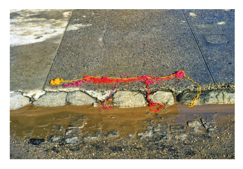
Figure 1. Cecilia Vicuña, Quipu in the Gutter, 1990, ritual performance, Beach Street, New York. Photo: César Paternosto.

written in a mixture of base 5 and 20 and with a full-fledged digit 0...[but it was Indian mathematicians, finally, [who] bequeathed humanity the place-value notation in base 10 that is now in use throughout the world."34 It is notable then that, akin to the Indian base 10 zero, the Inka, who also used base 10 mathematics, also had a zero and used place notation in their numerical khipus. Antie Christensen, summarizing Marcia and Robert Ascher, describes the Inkan zero, which was related to "the concept of nothingness" as well as a numerical placeholder in their khipus. The zero was made through the absence of a knot, "a cord without knots." The zero was used both as a placeholder in place-value notation—so, a recording of the number 902 would include the 9-knot in the top row of the khipu, an empty space in the next row, and a 2-knot in the bottom row—as well as a number in itself, in which an empty cord in a broader accounting khipu would signify no number, or the absence of other signs: "nothingness is represented by nothingness."36 Yet, since the Inkan placeholder is marked by a length of cord that is not knotted instead of knotted, we can say that there is a sign for zero in the figure of the straight line of thread.