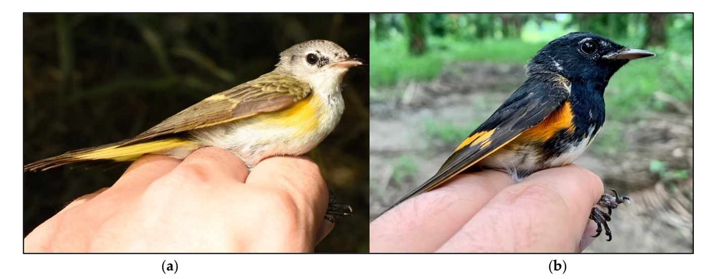
Figure 2. Pictures of the first year male American Redstart (SR6) captures in the first ( a ) and the second ( b ) wintering season, in oil palm plantations, Tabasco, Mexico.

Figure 1. Boxplot of mean showing territory size of American Redstarts ( Setophaga ruticilla ) in oil palm plantations and in native forest in Tabasco, Mexico. Lines represent, in bottom-up order: minimum, first quartile, median, third quartile, and maximum.