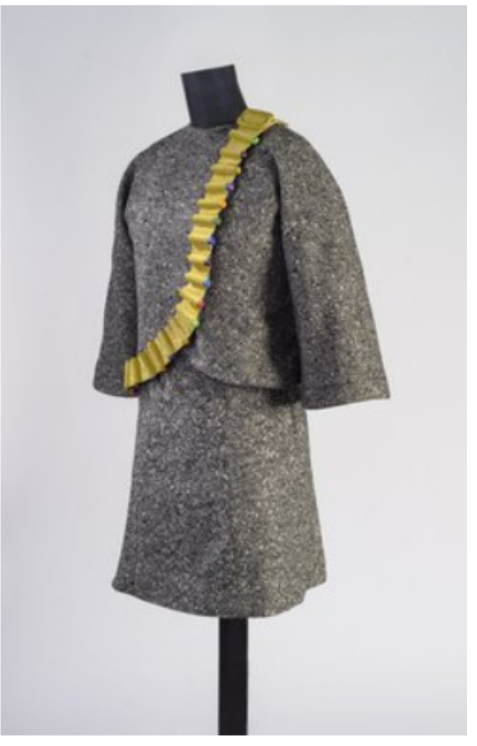
Fig. 4. Jae Jarrell, Revolutionary Suit , 2010 replica, 1969 original. Wool, suede, silk, wood, and pigment.

One of his goals in his art was to "reflect the everyday beauty of African-American culture that was overlooked due to the struggles for constitutional rights and respect during the civil rights movement."<sup>27</sup> This painting both highlights the struggle of the Civil Rights Movement by featuring a major political leader, but also attempts to beautify the struggle by transforming her into a sort of ethereal figure. Additionally, this piece exemplifies collaboration between artists of AfriCOBRA; in a note attached to the canvas, Jarrell tells the viewer that the suit in his painting is a direct representation of the Revolutionary Suit created by fellow co-founder and wife