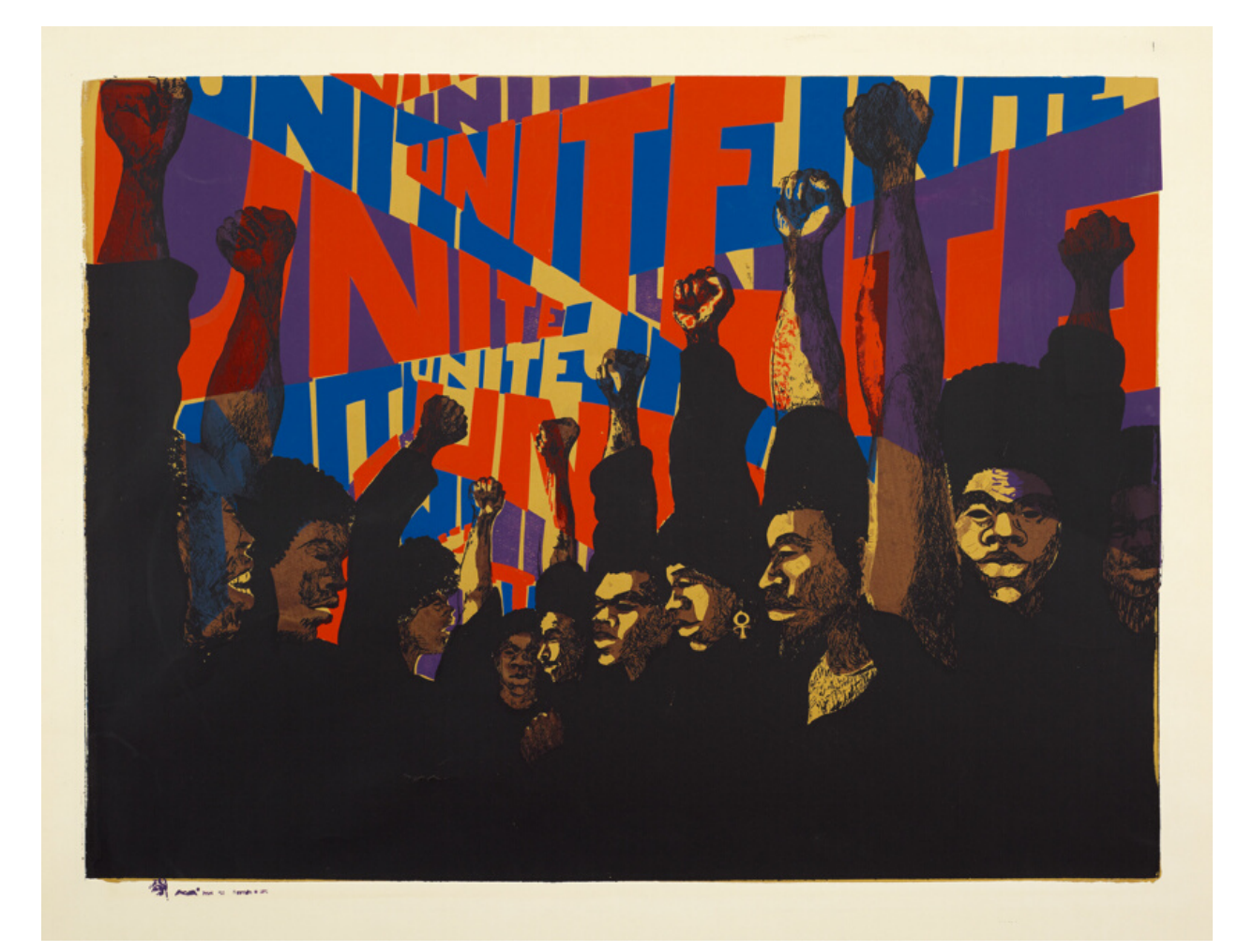
Fig. 2. Barbara Jones-Hogu, Unite, 1970. Color screenprint on ivory wove paper.

The other primary reason why this would be classified as bad art is because of its production value. This piece was specifically created to be reprintable and producible on a large scale. Additionally, this was painted on a simple piece of cardboard, a medium associated with amateur works and not suited to fine art. Not only does Donaldson's piece aesthetically alienate a white audience, his production and intentions are not typically found in fine art.