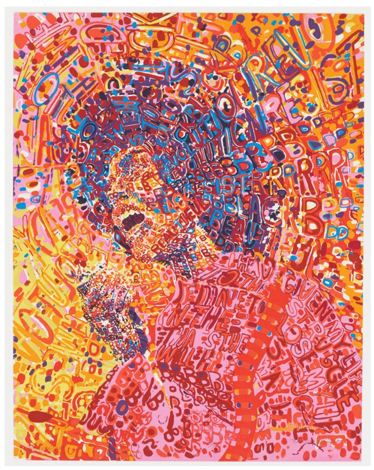
Fig. 3. Wadsworth Jarrell, Revolutionary , 1971. Acrylic and mixed media on canvas.